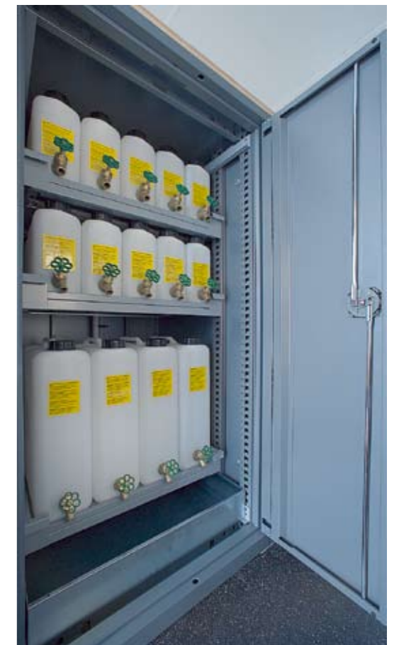
Keeping good order becomes child's play when equipment details are optimized for the job at hand. For storing small parts in drawers or liquids in cabinets Lista has just the right solution.